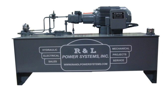
MILL HYDRAULIC POWER UNIT 80 GALLON