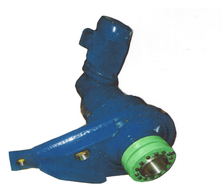
BEVEL-PLANETARY GEARMOTOR SHAFT MOUNTED TYPE WITH SHRINK DISC & TORQUE ARM

• ELECTRONIC DRIVE WITH VARIALBE FREQUENCY SPEED CONTROL