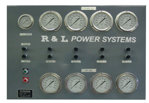
FOUR MILL GAUGE PANEL