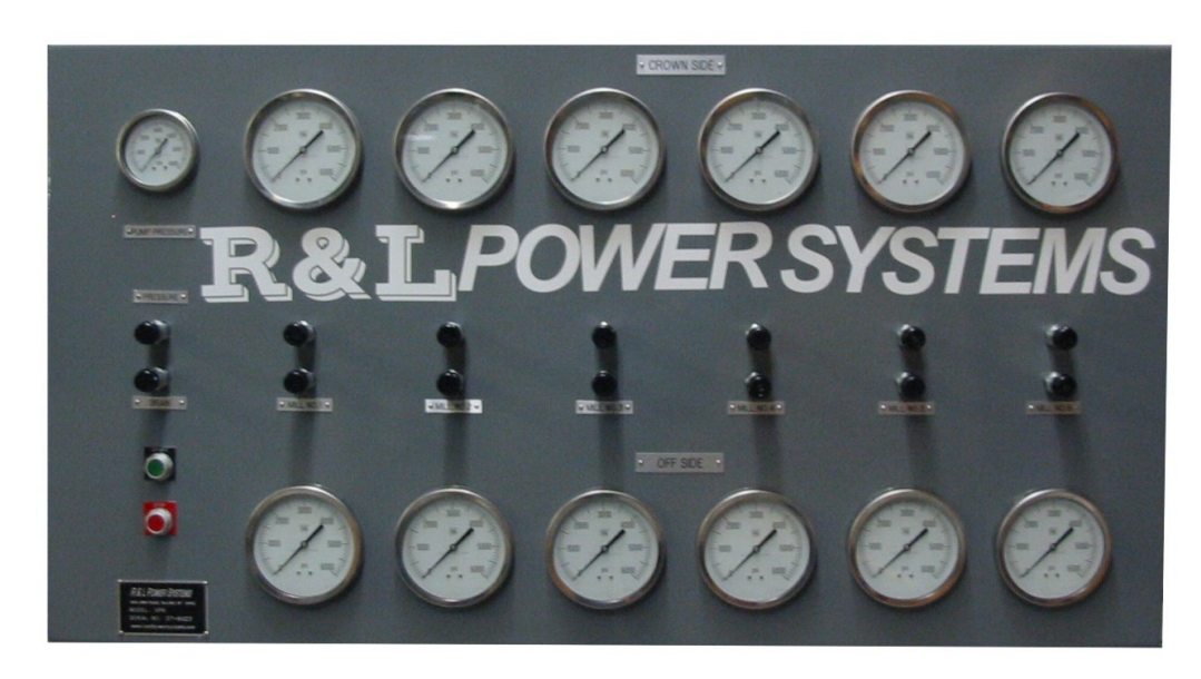
SIX MILL GAUGE PANEL