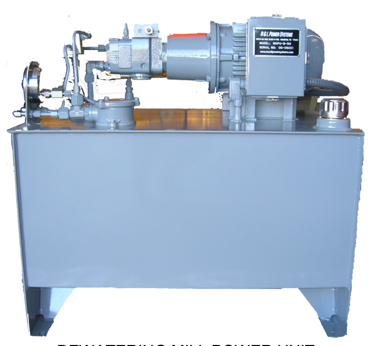
DEWATERING MILL POWER UNIT