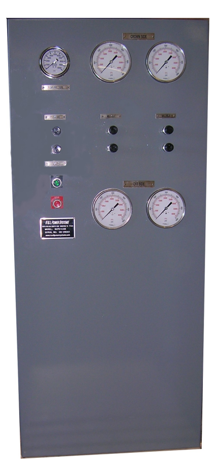
DEWATERING MILL CONTROL PANEL