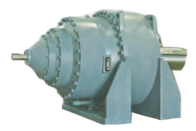
Four Stage Foot mounted planetary Gear Unit