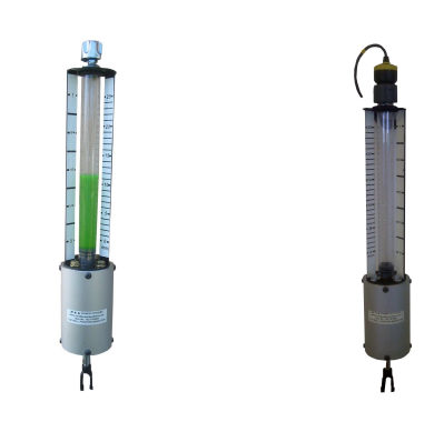
TOP ROLL POSISTION INDICATOR - VISUA -ELECTRONIC