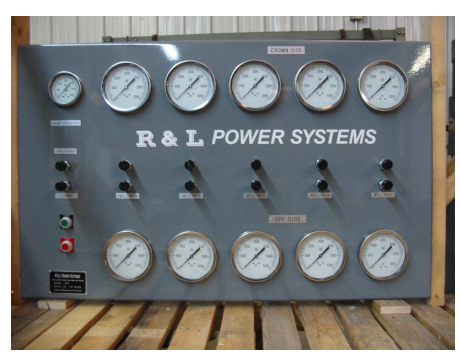
GAUGE PANEL - FIVE MILL