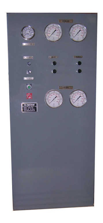
GAUGE PANEL STAND - TWO MILL